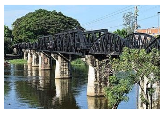
The River Kwai bridge as seen from the tourist plaza (NNE side) in Kanchanburi, Thailand in 2017.

What is true is that in 1943 a railway bridge was built by Allied POWs and Asian forced laborers over the Mae Klong river (which would be renamed "Khwae Yai" in the 1960s following the film's success) at a place called Tha Ma Kham, five kilometres from Kanchanaburi, Thailand. Actually, two bridges were built: a temporary wooden one and a permanent steel/concrete bridge a few months later. Both bridges were used for two years, until they were destroyed not by saboteurs but by Allied bombers. Neither looked anything like the bridge in the movie. The steel bridge was repaired and is still in use today.