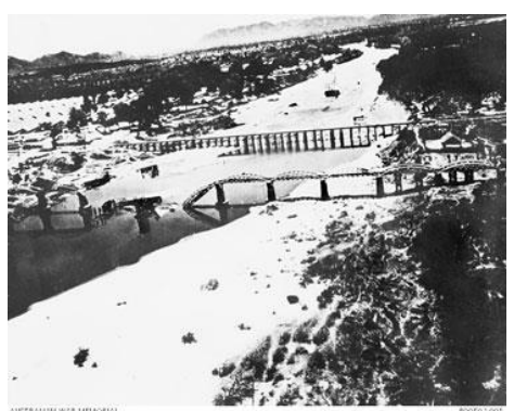
The real bridge on the "River Kwai" (actually built over the Mae Klong river). Aerial photograph shows severe damage to the middle spans caused by Allied bombing in May 1945.

The first POWs to go to Burma were Australians. They worked on airfields and other infrastructure initially before beginning construction of the railway in October 1942. The first POWs to work in Thailand at the southern terminus were British soldiers. More POWs were imported from Singapore and the Dutch East Indies as construction advanced. Construction camps housing at least 1,000 workers each were established every 5–10 miles (8–17 km) of the route. Workers were moved up and down the railway line as needed.