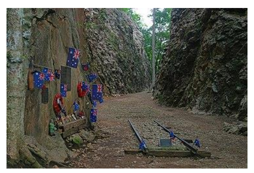
Hellfire Pass: a railway cutting on the railway noted for harsh conditions and the heavy loss of life suffered during construction. The name was supposedly inspired by the sight of emaciated prisoners laboring at night by torchlight, said to evoke a scene from Hell.

If the ambitious engineering feat pulled off by the Japanese in the Southeast Asian jungle was ruthless and brutal, it was also short lived. When the war ended, the railway was confiscated by the British. On January 16, 1946, the British ordered Japanese POWs to remove a four-kilometer stretch of rail between Nikki and Sonkrai. The railway link between Thailand and Burma was separated to protect British interests in Singapore. The line was closed completely in 1947, but the section between Nong Pla Duk and Nam Tok was reopened ten years later and still operates to this day.